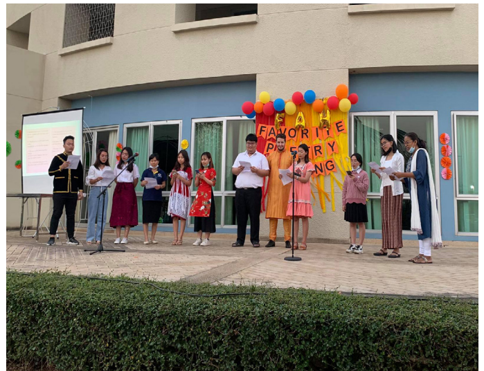
TOP: FAH students present during the favorite poetry evening; BOTTOM: FAH faculty and students sing a special number during the event