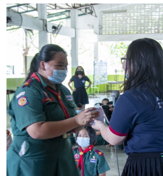
LEFT: AIU Student gives out event survey to the Students at the local school; MIDDLE & RIGHT: AIU Students presents about the small business topics to the local students.