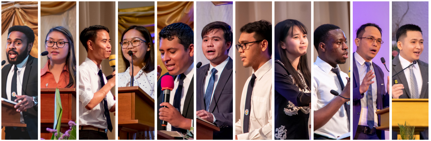
Speakers from different faculties preach throughout the morning and evening sessions of the Festival of Faith week-of program