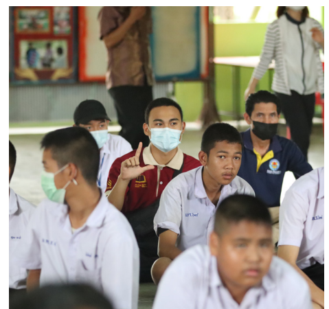
FRS students teaching at Thai Rat school

We continue to pray for the students in Thai Rat school to be touched by the lessons and activities provided for them, and we also pray that they will practice kindness in their day-to-day life as it is something that our Lord Jesus Christ also practiced.