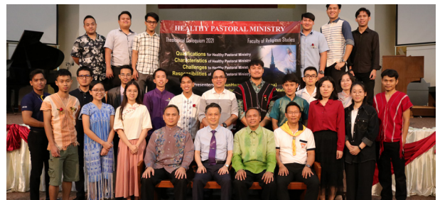
Group pose for a picture with all students and faculty of FRS along with the church pastor

Several resources were shared with all the participants before, during, and after the colloquium. These will help both potential and current pastors make their pastoral ministry more successfully