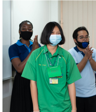
LEFT: Signing of MOU between AIU & Debsirin Phukhae School; RIGHT: Debsirin students having a preview of the class environment at AIU