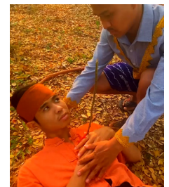
TOP, MIDDLE, & BOTTOM: Virtual Cultural show presentation from different clubs to represent their countries during the online Cultural Celebration program on the AIU FB page