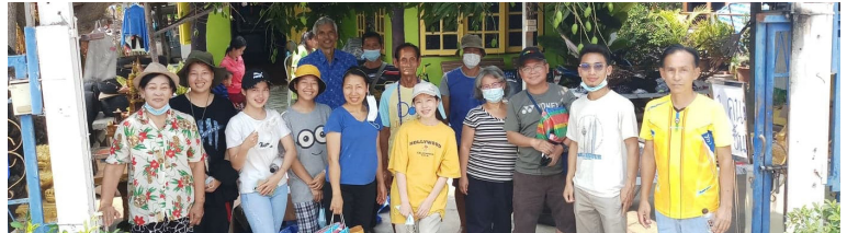
LEFT & TOP RIGHT: Sorting out the clothes donated by the AIU family; BOTTOM RIGHT: Meeting the Ban Mak village families to share the joy and blessings